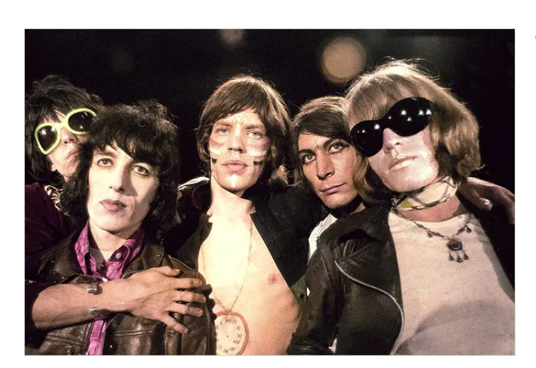
The Rolling Stones in 1968.

"And you can imagine it working very well in a utopia, whether it's a desert island or a plot of land in the wilds of the Appalachians where 300 people are making love, not war. It might work that way. But it doesn't seem to be a serious operating factor in the way the world goes."